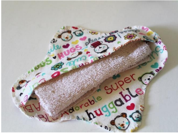
Step 7: Insert the liner into the pocket of the cover.