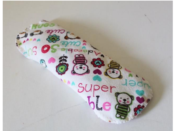
Finished pad is ready for use.